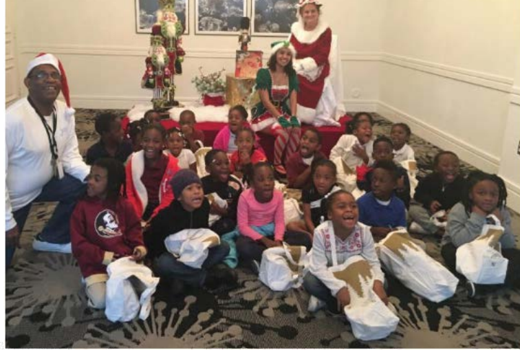
Our FRC 2nd Graders meeting Mrs. Claus at the Seagate Hotel & Spa in Delray Beach

This Year's Holiday Program was one to remember! Held at our Family Resource Center (FRC) with performances from each of our three campuses and the Early Learning Program (ELP). We were delighted to see a range of talented young ladies and gentlemen including our FRC Step Team & Dance Team, Village Academy Choir & Dance Team, Pine Grove Hand Bells and a performance from each FRC & ELP grade level!